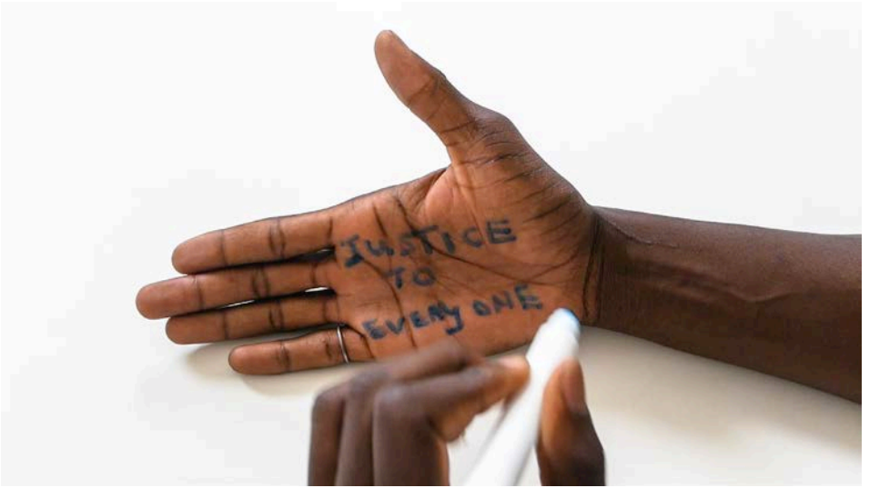
Figure 2. Bianco Valente, Baricentro , 2018, video, endless loop.