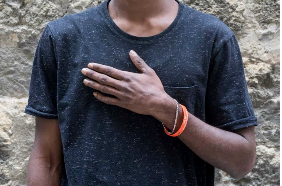
Figure 3. Bianco Valente, Baricentro , 2018, fine art print.