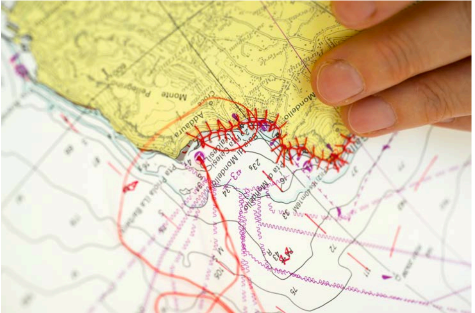
Figure 4. Bianco Valente, Coastline (Gulf of Palermo), backstage, 2016.

finite shades of colour that the cradle of western civilization can take on, depending on when and where you look at it” (Valente 2018, p. 33). In the work we see a multitude of strips of paper cut out from pictures advertising tourist resorts and holiday destinations on the shores of the Mediterranean. A study in the use of colour in marketing, to give expression to the imagination that goes with choosing the more exotic travel destinations. The work, which has a strong aesthetic impact, succeeds in its aim of enchanting the viewer with the beauty of the shades of blue, which reflect the collective idealization of the sea. Another face of the landscape, which presents itself as an icon, and is deconstructed when we move closer to the work and perceive the nature of the piece.