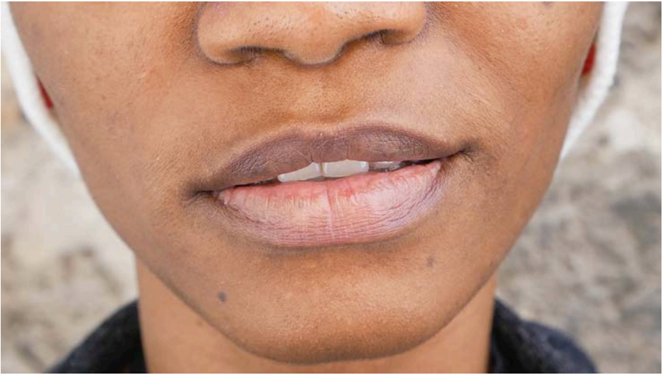
Figure 1. Bianco Valente, Constellation of me , video, sound. 2018.

Names pronounced repeatedly with a slow rhythm are formed between the lips and teeth in the breath of unknown people, who address the visitors to the exhibition by communicating their identity. It is not something to be taken for granted. On the contrary, in a simple way, it gives back to every migrant what has been taken away from them by the images in the media, by the saturation of the space of listening and dialogue. In fact, the mass-media representation on television is based on the depersonalization of the individual, the denial of sound, voice and presence. Against the background of a Mediterranean without history, individual people are commonly represented as a nameless crowd. The first step towards developing a new, shared meaning for this landscape is to begin the empathic journey again, starting from the moment of meeting. The choice of the artists not to show the whole face, with the eyes not visible, keeping the representation of the other from